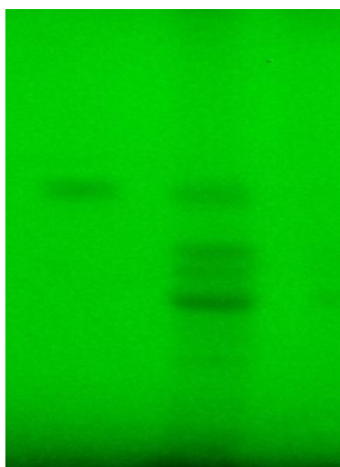
Fig. 1: Comparison TLC of isolated fraction and methanolic extract of Hygrophila salicifolia whole herb run in column chromatography Under UV254 nm

The melting point was determined by capillary tube method.