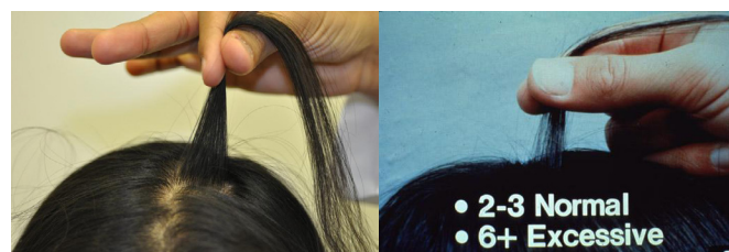
Fig. 4: Hair pull test

The differentials are telogen effluvium, postpartum loss of hair, diffuse cicatricial alopecia, and diffuse alopecia areata.