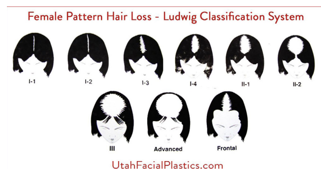
Fig. 2: Ludwig scale of pattern hair loss in female

This test is performed to check hair fragility and hair shaft abnormalities. A tuft of hair is held between the fingers at