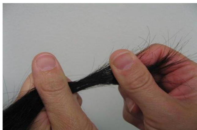
Fig. 3: Tug test