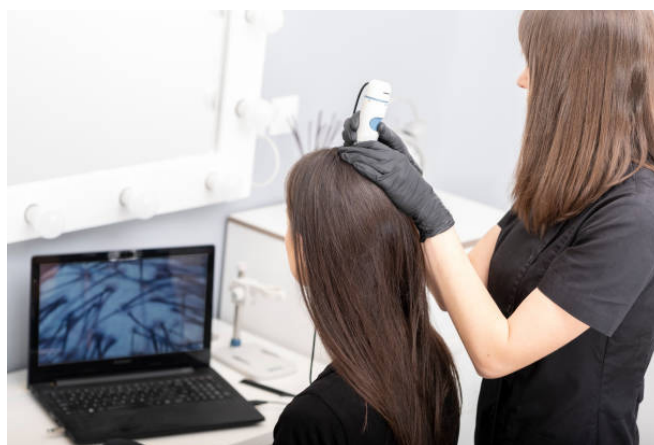
Fig. 5: Trichoscopy